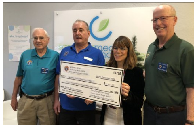
Dinner for Life check presentation