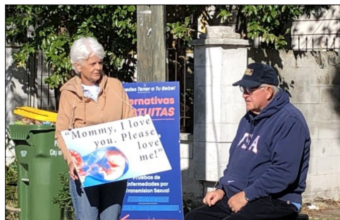
vigilers-counselors at Olanned Parenthood

Incarnation serves as the coordinator for 40 Days for Life 365 at the prayerful vigil at Planned Parenthood. The December vigil was on Wednesday, December 4th.