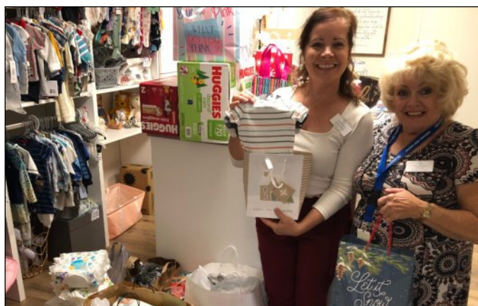
Incarnation Baby Shower donations to SMPC

The annual Incarnation Baby Bottle Drive to support the operation and maintenance of the ultrasound machines at SMPC took place in October.